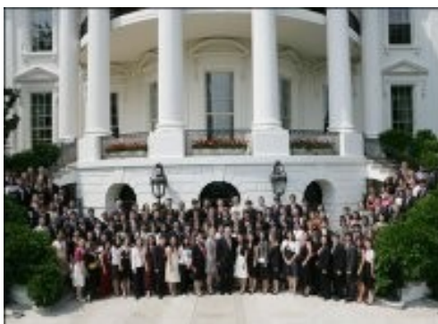
Scholars at NRW 2007

will join together for an NRW agenda packed with educational, fellowship and celebratory events, including opportunities to meet and mix with Presidential Scholar alumni.